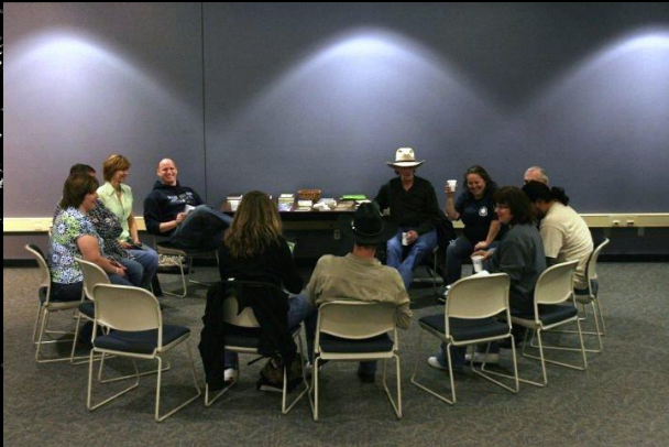
Alpha Discussion Groups: March 2010