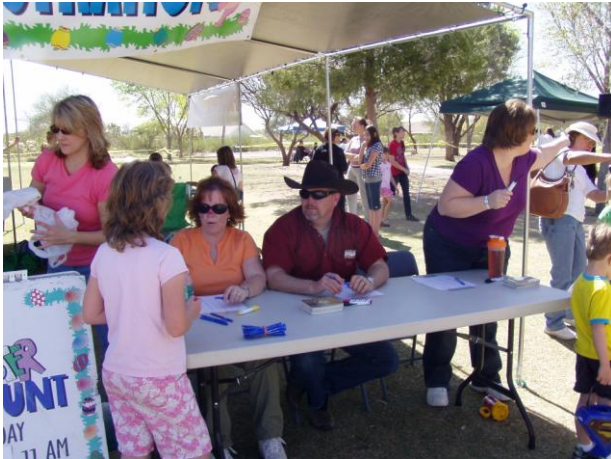
The 9th annual Easter Egg Hunt in Purple Heart Park on Saturday