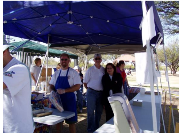
2010 Easter Egg Hunt